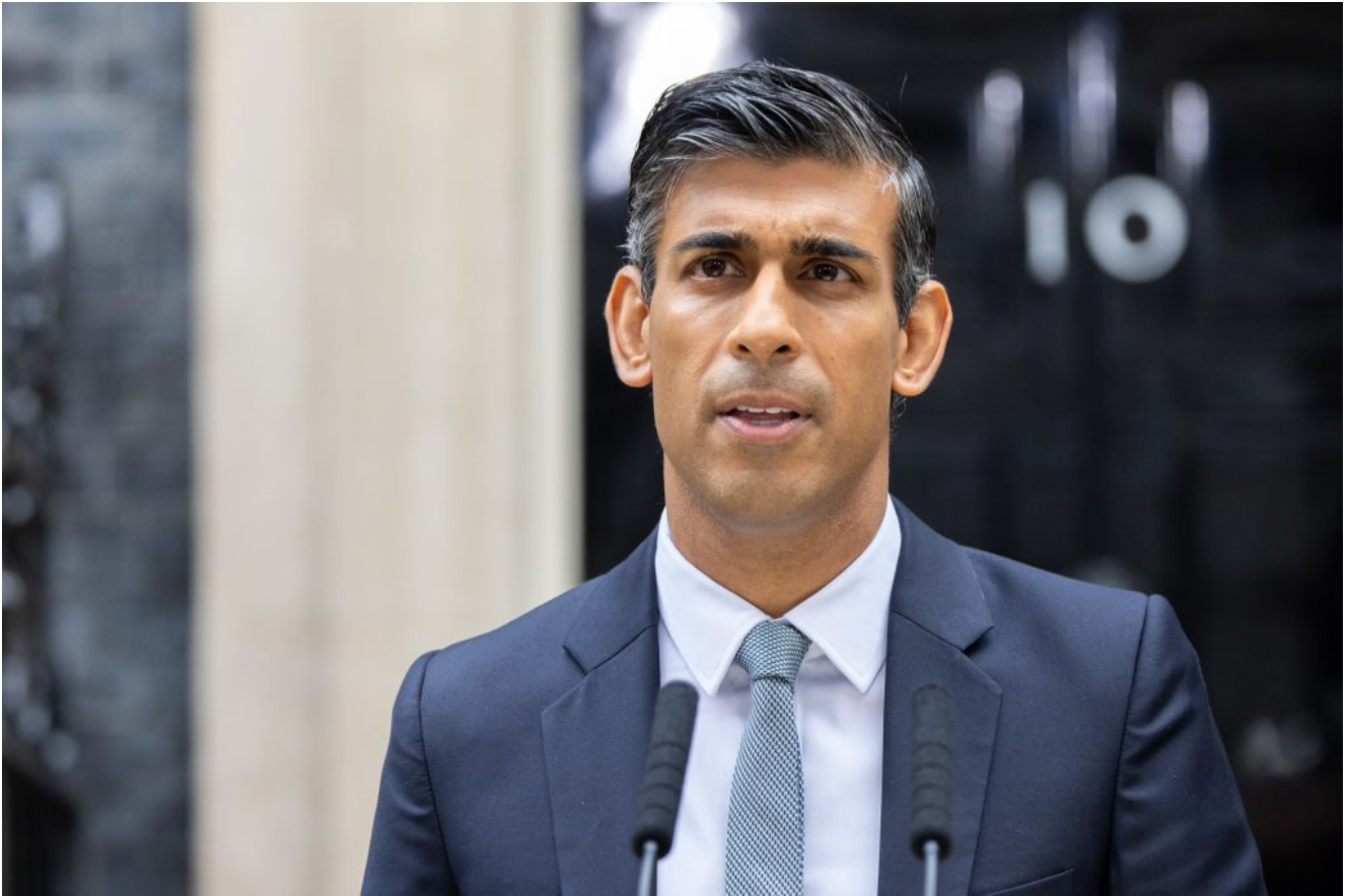
Rishi Sunak, United Kingdom Prime Minister