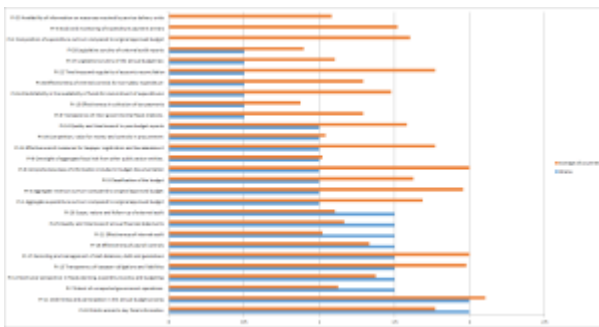
Figure 2: Ghana PI score comparisons

Download a pdf version of Figure 2 here ( Ghana PIs ) to review individual PI scores in more detail.