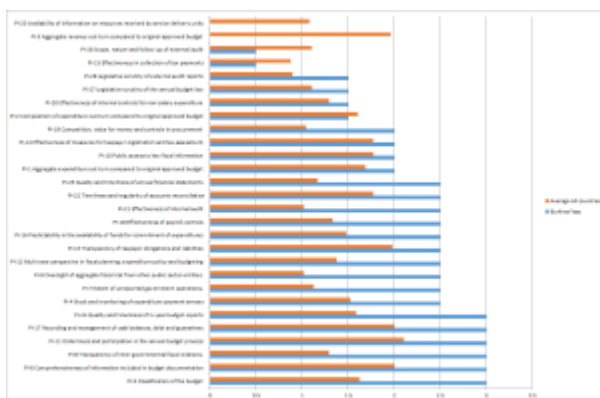
Figure 2: Burkina Faso PI score comparisons

Download a pdf version of Figure 2 here ( Burkina Faso PIs ) to review individual PI scores in more detail.