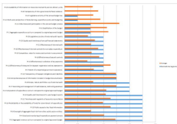
Figure 2: Bosnia and Herzegovina PI score comparisons

Download a pdf version of Figure 2 here ( Bosnia and Herzegovina PIs ) to review individual PI scores in more detail.