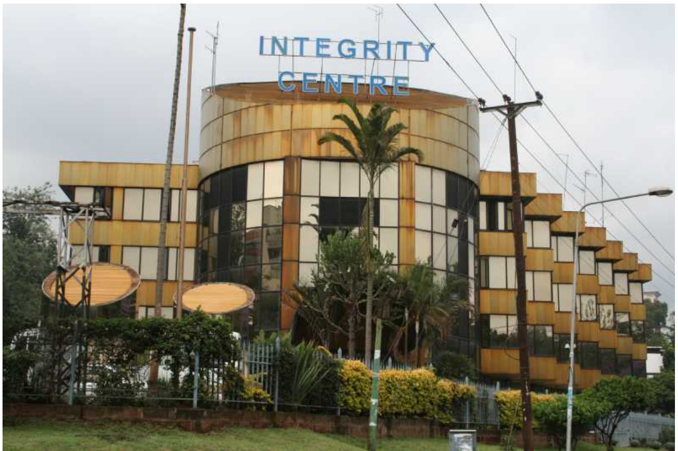
Kenya's Ethics and Anti-Corruption Commission