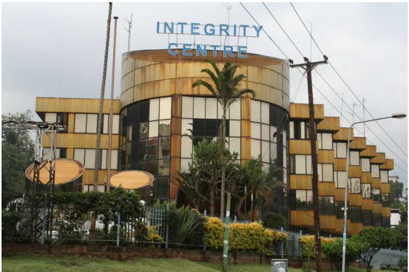
Kenya's Ethics and Anti-Corruption Commission