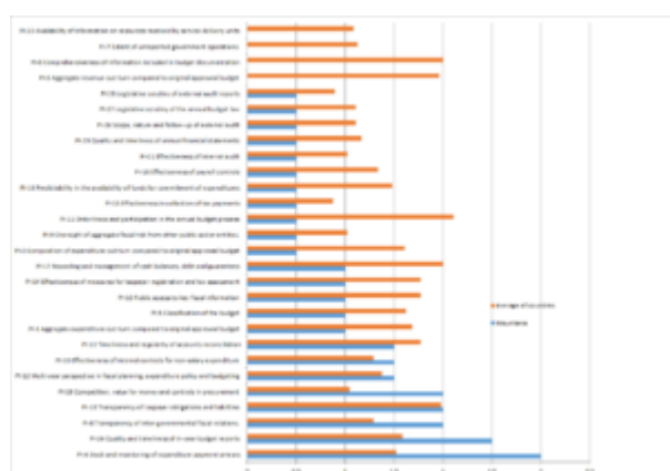
Figure 2: Mauritania PEFA indicators' relative performance

Seventeen of the above-mentioned twenty-four countries feature in Transparency International's 2016 Corruption Perceptions Index. Sixteen countries (Ghana is the exception) recorded below –average scores in TI's 2015 and 2016 surveys; details of the 2015 and 2016 scores and the percentage change between these periods are presented in Table 1.