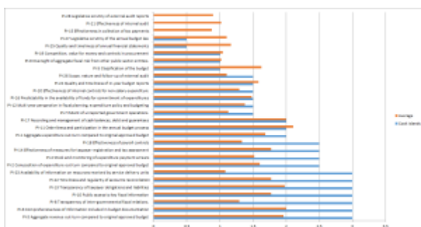
Figure 2: Cook Islands PI score comparisons

Download a pdf version of Figure 2 here ( Cook Island PIs ) to review individual PI scores in more detail.