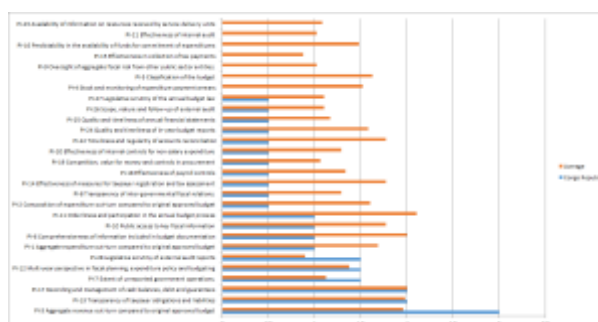
Figure 2: Republic of Congo PI score comparisons

Download a pdf version of Figure 2 here (the Republic of Congo PIs) to review individual PI scores in more detail.